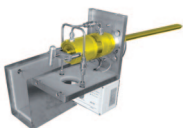
Gas Sampling Probes